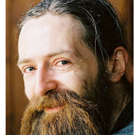
Aubrey de Grey